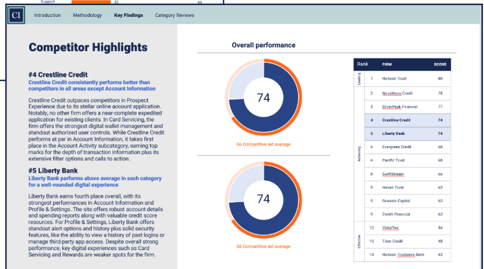
Summary highlights of each competitor